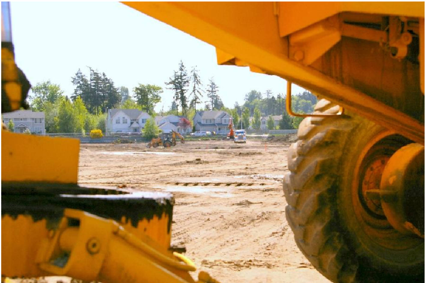
Earth-moving equipment prepares the ground for field improvements at Honey Dew Elementary School.